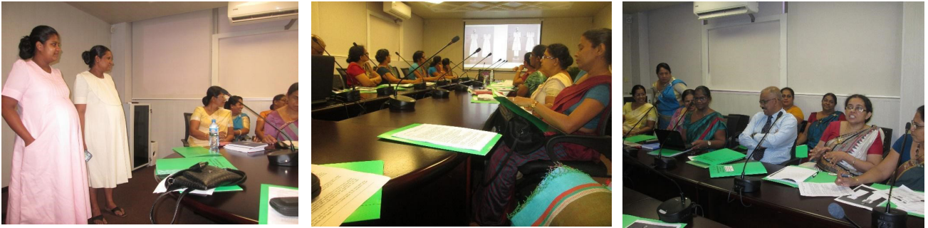
Introducing proto types of maternity wear: Ministry of Education Isurupaya Battaramulla, April 2018