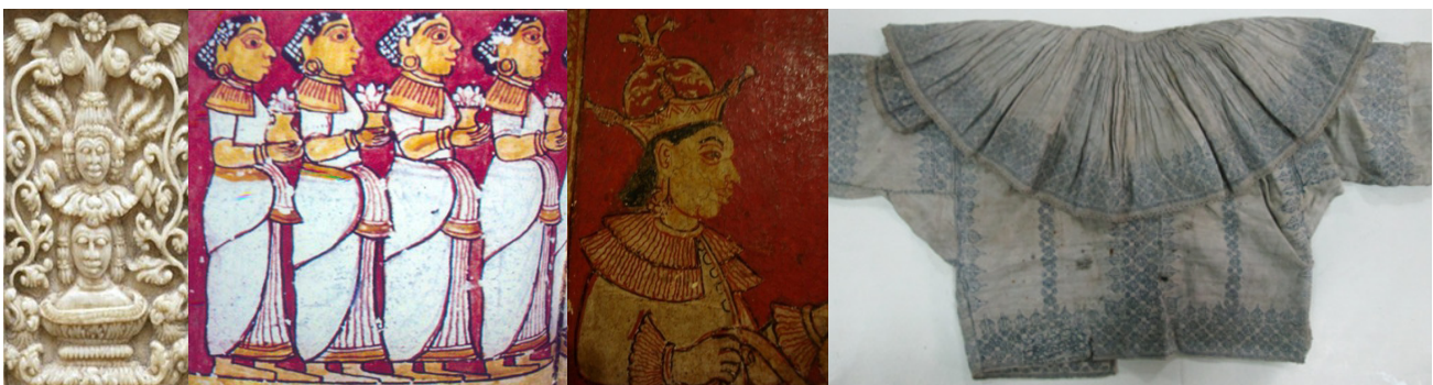
Queens of Kotte with "manthe" frilled Jacket