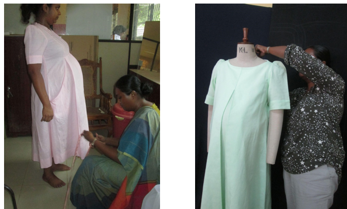
Frequent observation of measurements of the pregnant teachers at the school premises Bomiriya Madya Maha Vidyalaya, Kaduwela, 2018