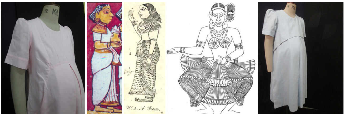
Inverted pleat developed by inspiring horizontal down pleats of the royal and elite female costumes