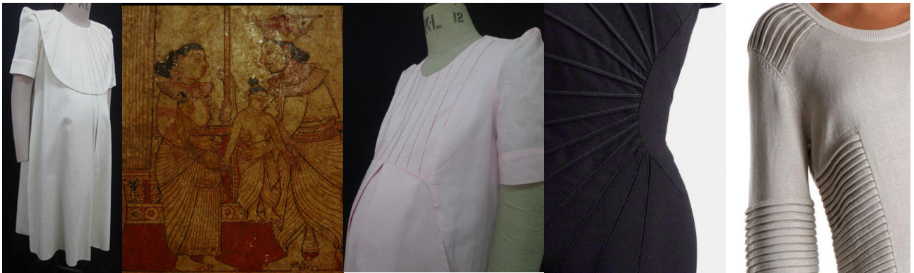
Fripped details inspired of creating TEXTURE on design by using pin tucks