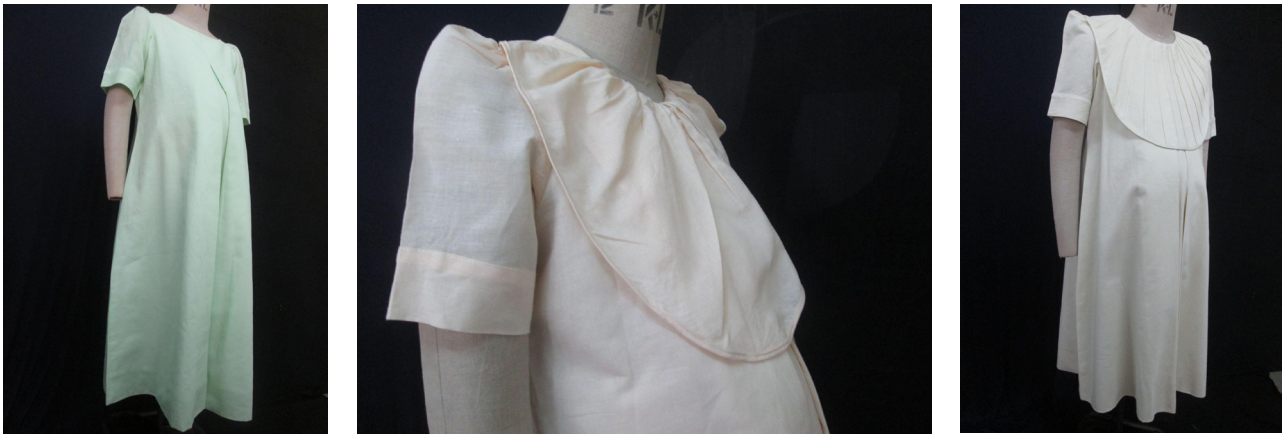
The vertical fold of the center drapes at two layers downwards creates a ramification of delicate, flowing and rippling thus dynamic design element of dress. This vertical fold emphasizes apparent height of the wearer and also provides ease of movement.