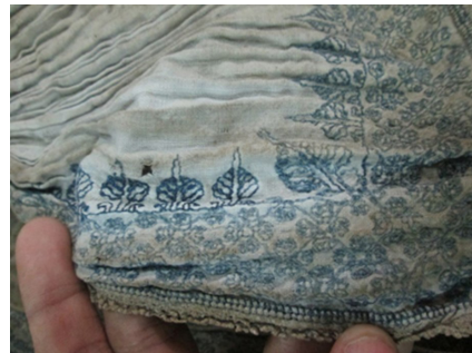
Traditional hand embroidery work on fripped collar Manthe Jacket, National Museum, Colombo, Reg. No 35-175-190